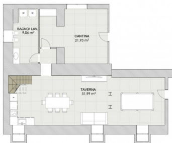
PIANO INTERRATO scala 1:100